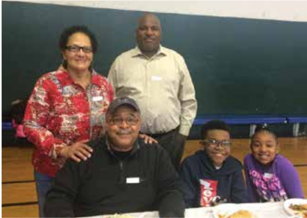
Our veterans and our families came together, shared memories, and enjoyed a holiday dinner at Morristown Neighborhood House.

Our premier female veterans' program, Operation Sisterhood, provides peer support for our women in uniform to share their experiences that promote meaningful emotional healing and resources to help them readjust to civilian life.