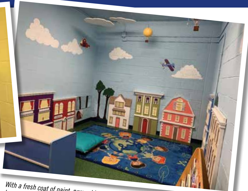
With a fresh coat of paint, new cabinetry, and more, our Toddler Room has become a beautiful interactive space for our young students!

"Two rooms at Morristown Neighborhood House got a much-needed makeover by J&S Designer Flooring as part of Design for a Difference, an initiative where members of the design community donate time and materials at a local charitable organization." (Source nj.com)