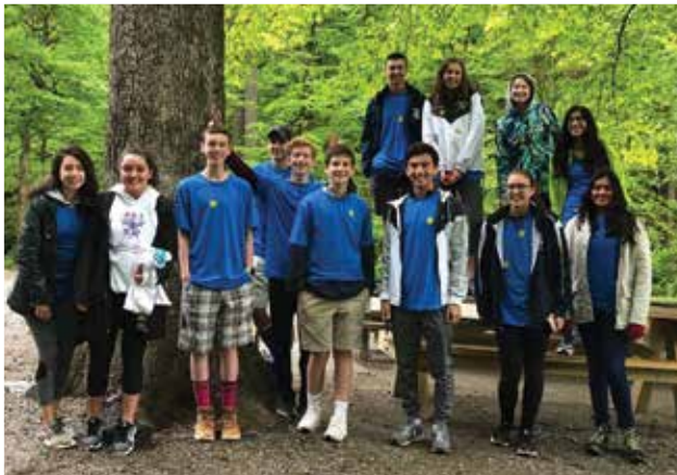
Members of our Junior Board volunteer at Cornerstone Family Programs and Morristown Neighborhood House, including our Annual Community Family Day!

The Junior Board is comprised of 20 high school students from the area making change in the community. Our Junior Board meets monthly to discuss ways to get involved in philanthropy, service, volunteering and planning events in support of Cornerstone Family Programs.