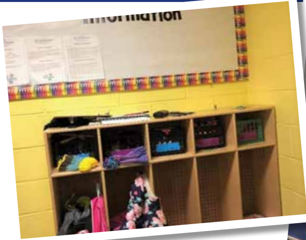
A small storage area in our Toddler Room "before" the transformation