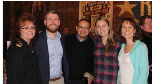
We were truly honored to be recognized at Affinity Federal Credit Union's 2nd Annual Pints for a Purpose, which raised over $2500 for Operation Sisterhood!

Operation Sisterhood is proud to support over 850 female veterans and counting.